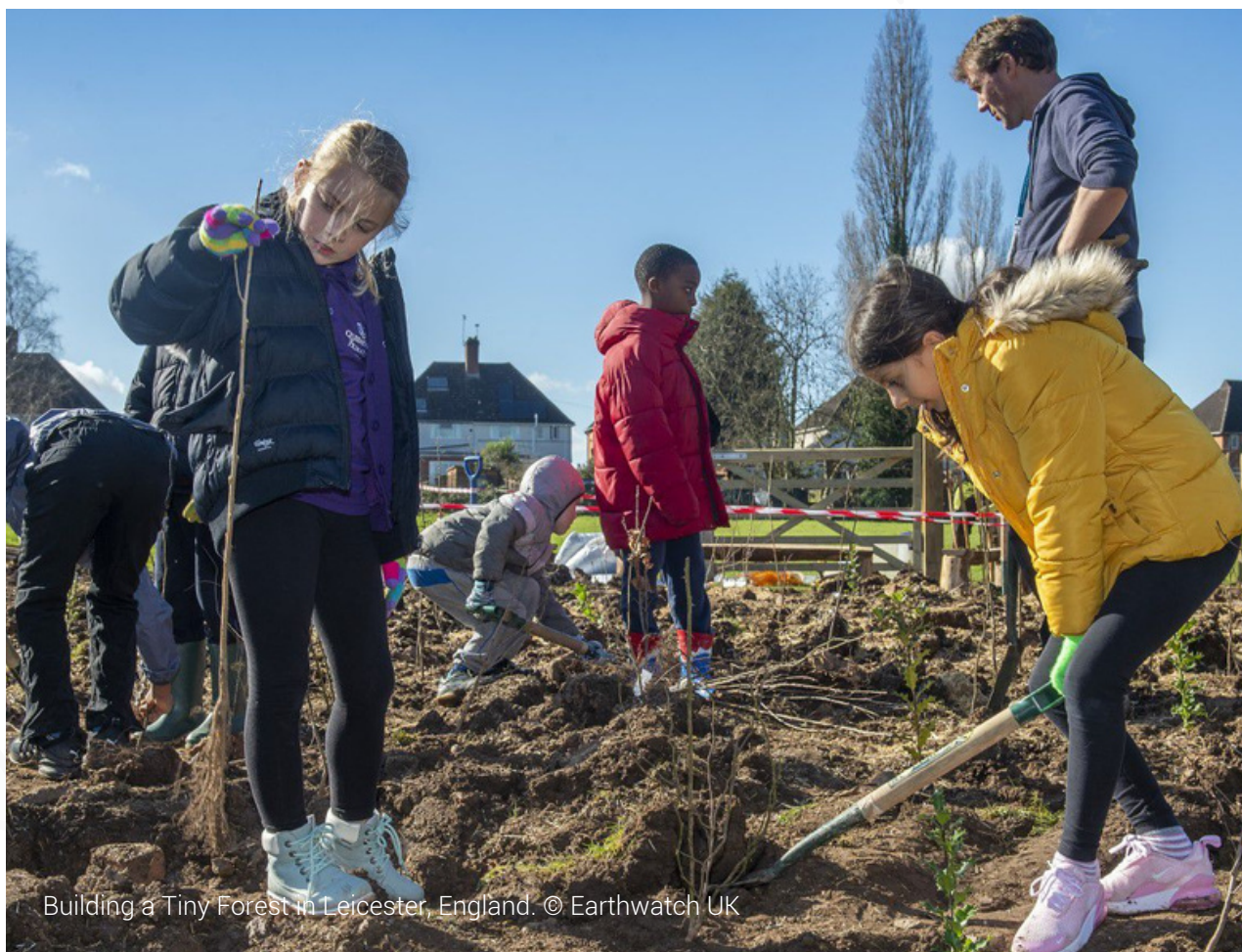
Building a Tiny Forest in Leicester, England.

Using an established planting method (called the Miyawaki method) that includes soil enrichment, hyper-diverse indigenous plant selection, and a dense planting structure; Tiny Forests are supercharged, growing up to 10 times faster than traditional forests and becoming up to 100 times more biodiverse than monoculture forests.