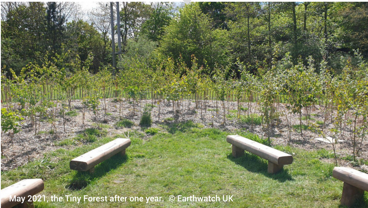
May 2021, the Tiny Forest after one year.