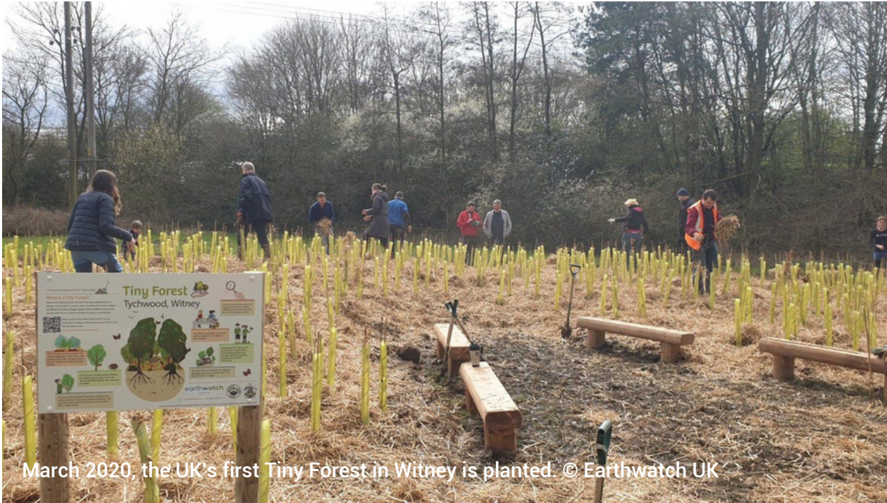
March 2020, the UK's first Tiny Forest in Witney is planted.